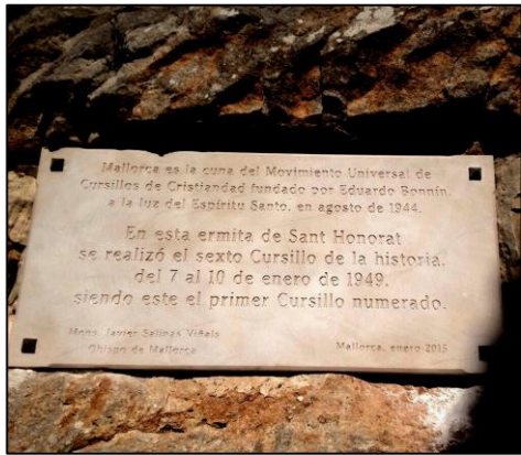
First Numbered Cursillo Plaque – January 7-10, 1949