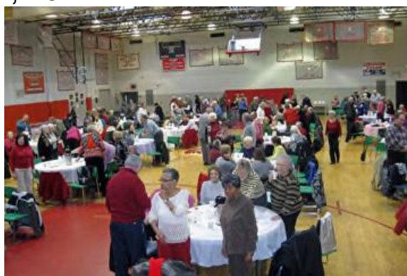
Cursillistas breakfasting in Holy Child Gym