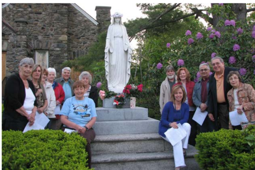
Carmel & Mahopac Ultreya May 18, 2012 Our Lady of the Lake / Mount Carmel

For more information, refer to the National Cursillo Center Mailing 2012 titled, " The Ultreya And Its Importance To The Person " (February, 2012).