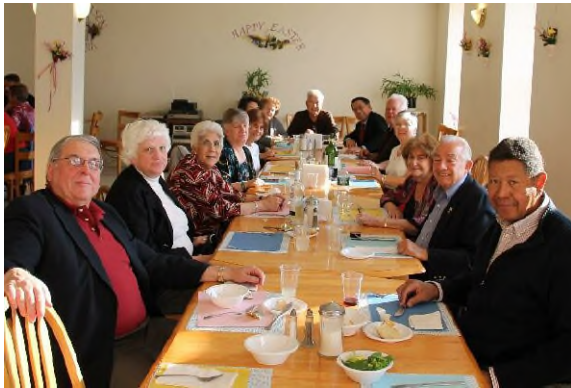
Cursillistas enjoying the fellowship and pasta dinner

Everyone had a festive time at this event, especially enjoying the beautiful view of the Hudson River while dining. The Sisters thanked all the Cursillistas who attended the Gala and extended an invitation to come to their next dinner event.