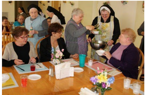
Sisters serving their guests at the Pasta Gala