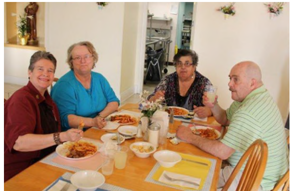
Many other Cursillistas supported the Sisters' Gala