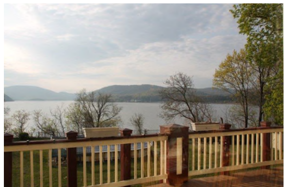
Spectacular view from Mount Saint Francis