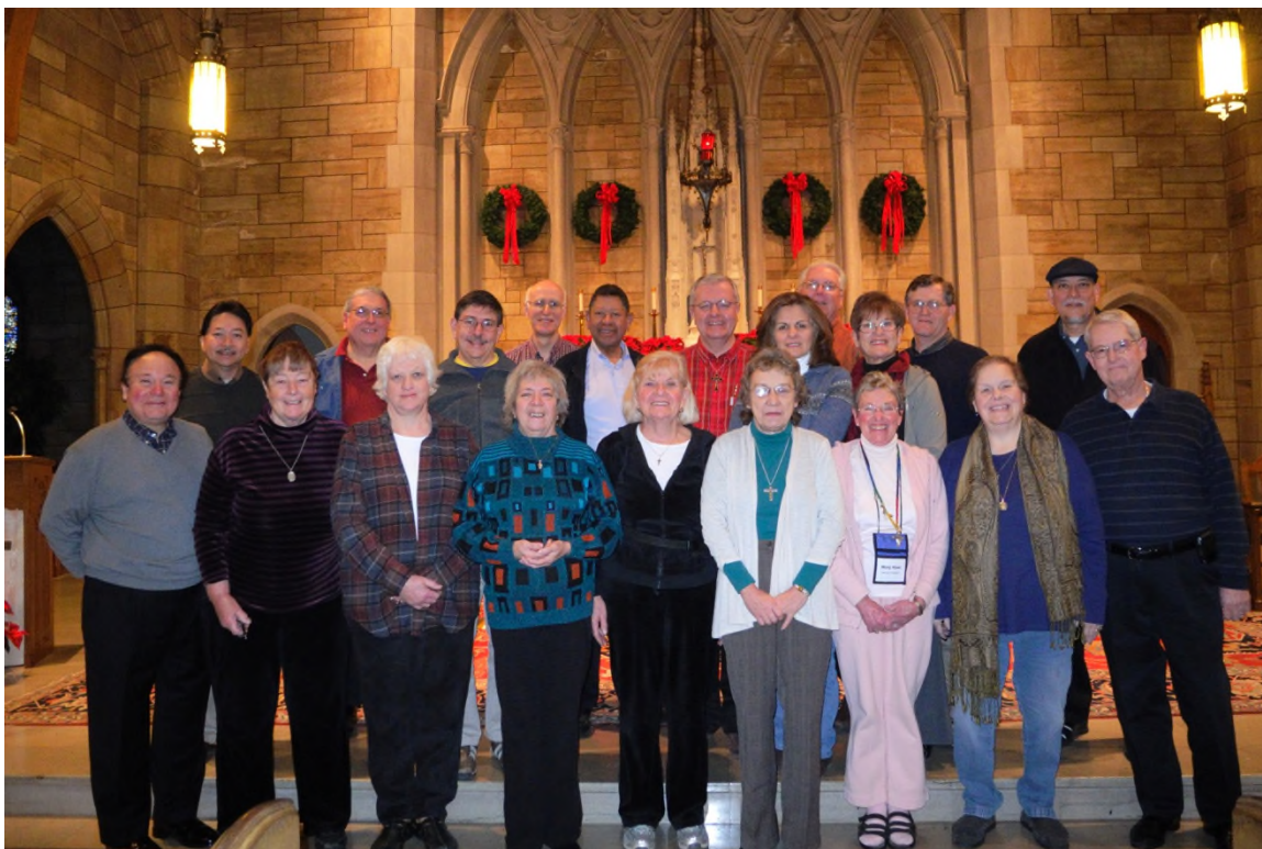
Group photo of the CDC attendees in the sanctuary of St. Thomas Chapel

The Cursillo de Cursillos three-day weekend is to develop a deeper understanding in the Cursillistas attending of the foundational charism: mentality, essence, purpose, strategy and methodology of the Cursillo Movement. There are five Meditations and 15 Rollos presented by the team from National and Regionals, which address the why and what of we do in Cursillo. The ultimate goal is to provide Cursillistas the means to form and maintain Friendship Groups, conduct an efficient School of Leaders, conduct authentic 3-Day Weekends and implement an authentic PreCursillo, Cursillo and PostCursillo, based on the love of God and neighbor.