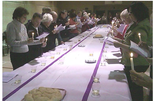
Scene of the Agape which preceded potluck supper