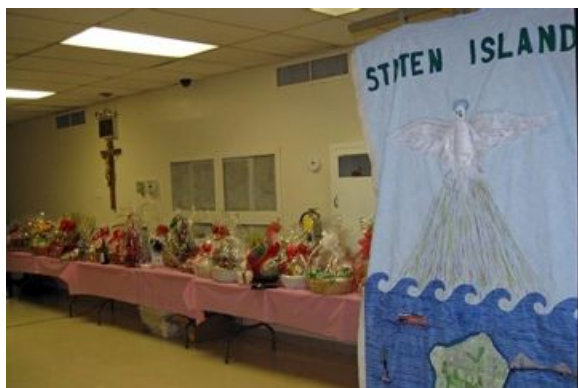
View of Raffle Prizes