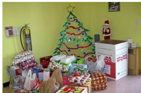
Donated Christmas Gifts for needy families