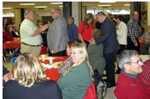
Cursillistas enjoying breakfast