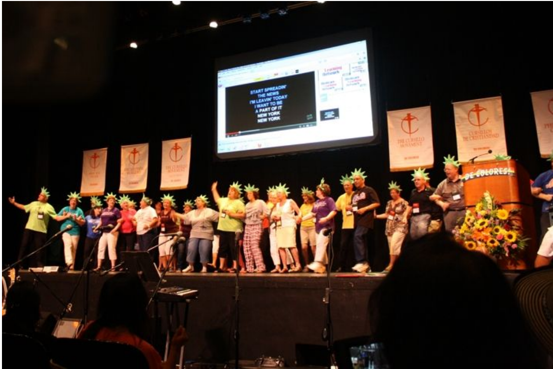
Region 1 Cursillistas performing on stage “New York, New York” for the attendees.