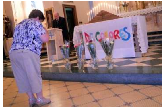
Remembering those who entered their fifth day