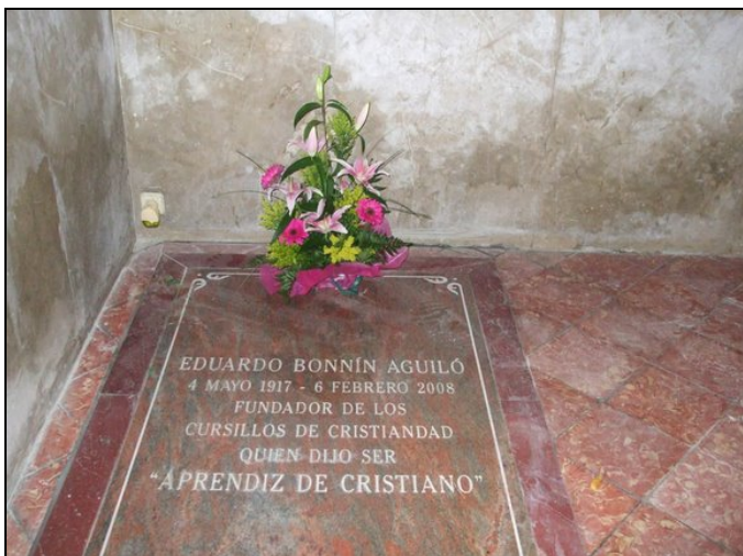
EDUARDO BONNIN AGUILO 4 MAY 1917 - 6 FEBRUARY 2008 FOUNDER OF THE CURSILLOS IN CHRISTIANITY WHO SAID HE WAS A “CHRISTIAN APPRENTICE”

With the same outlines, lessons, and rollos used in Cala Figuera (with minimum changes), four more Cursillos were given between 1945 and 1948, paving the way for all the Cursillos which have been celebrated to date. This includes a Cursillo weekend held in San Honorato on 7 January 1949, which (after the “elation” of the pilgrimage to Santiago) was officially numbered as Cursillo #1.